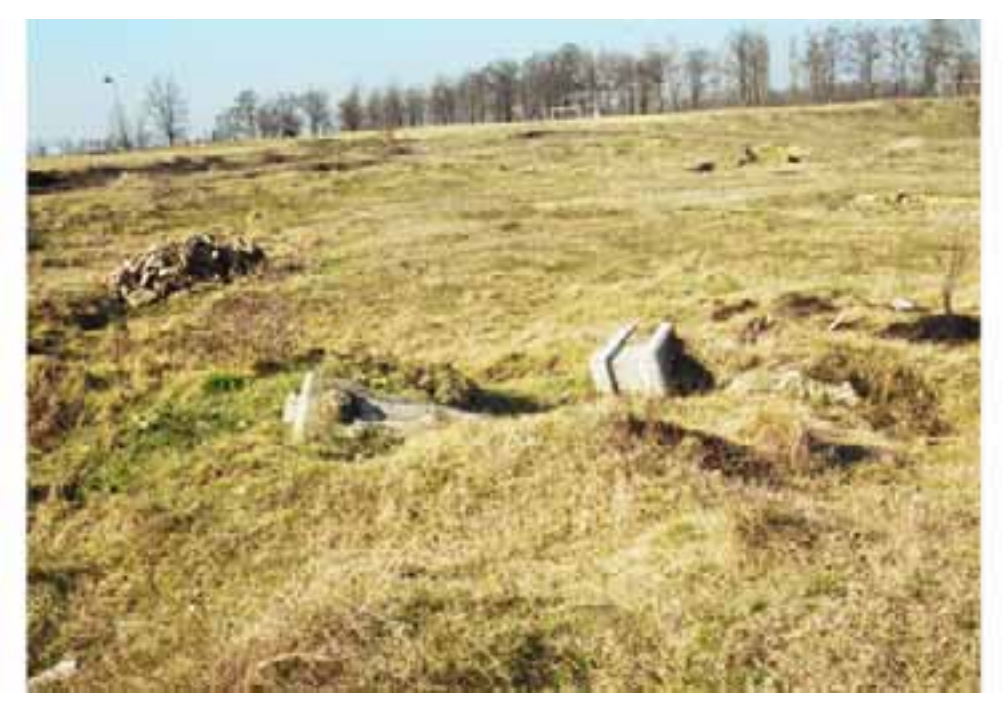
Jewish cemetery in Srbobran, Serbia